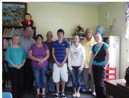
We enjoyed getting to know members of the Confirmation Class and partnering in support of their faith journey.