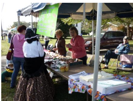
The Annual Driver Days celebration and sale netted close to $600 for our team.